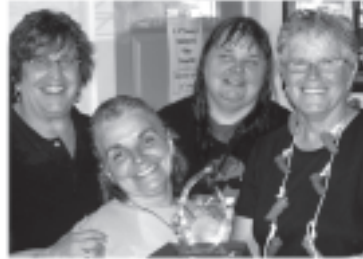
Red Hot Chili Peppers win the popular vote!