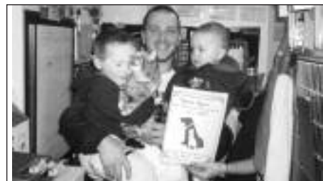
Mousie Lewis #6000 with her family sheltered indefinitely. More puppies and kittens than a kind community can, in good conscience, kill.

We've all seen the charts depicting how one cat or dog, her offspring and their offspring can produce thousands of puppies and kittens in a very short time. More puppies and kittens than can be adopted or